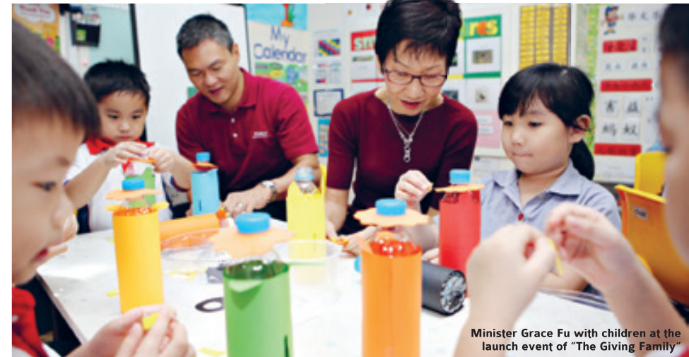
Minister Grace Fu with children at the launch event of "The Giving Family"

PARENTS JOIN PRE-SCHOOLS TO TAKE THE LEAD IN RAISING COMPASSIONATE CHILDREN.