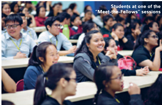
Students at one of the "Meet-the-Fellows" sessions