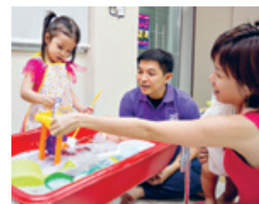
KidSTART supports the parent-child relationship and interactions