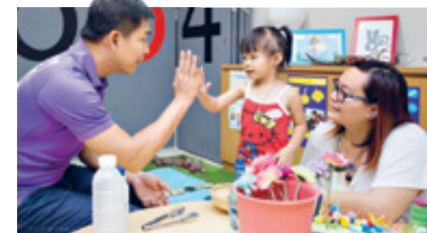
Minister Tan Chuan-Jin at the KidSTART Group Trial Appreciation Event

"There is strong evidence that parent-child interaction plays a vital role in a child's development," said Minister for Social and Family Development Tan Chuan-Jin at the KidSTART Group Trial Appreciation Event on 5 November 2016. "The response from parents has been very encouraging. Through KidSTART, we hope to work with community partners to better support families. It's true when we say it takes a village to raise a child, because together we can build an ecosystem of support for our children." ♥