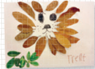
Trent Low, 5