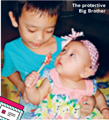
The protective Big Brother

PARENTS ON THAT MOMENT WHEN THEY REALISED THEIR LITTLE ONE WASN'T SO LITTLE ANYMORE.