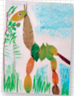
Brandon Tan, 5

Some outstanding "Leaf It To Art" entries from last issue's Thrive: Play segment: