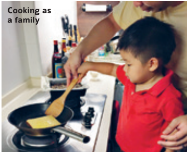
Cooking as a family

PARENTS SHARE HOW THEY CREATE AN ENRICHING HOME ENVIRONMENT TO ENHANCE THEIR CHILD'S LEARNING THROUGH FUN AND PLAY.