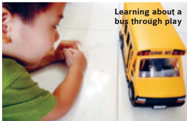
Learning about a bus through play