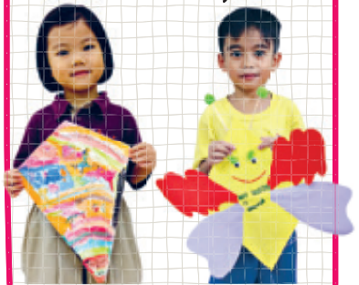
Chen Yetong, 5