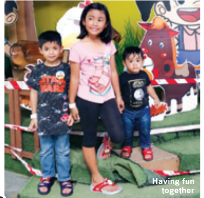
Having fun together

Every child needs space and time to explore. I often encourage my three children to do things together at home, with little interference from my husband or myself. The older ones settle disputes among themselves, practise negotiation skills, and learn how to pacify the little one. Through interaction, they also learn to appreciate and respect one another.