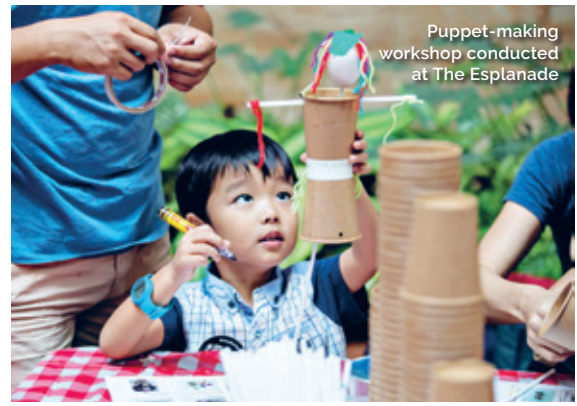
Puppet-making workshop conducted at The Esplanade

→ The Dance Appreciation Series is a regular collaboration with the Singapore Dance Theatre. It features excerpts from Western classical ballet with narration, which makes it more accessible for preschoolers. Kicking off the 2019 series is the hour-long Introduction To Don Quixote (9 Feb).