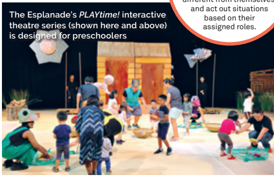
The Esplanade's PLAYtime! interactive theatre series (shown here and above) is designed for preschoolers

What is 'Dramatic Play'? A type of play where children pretend to be someone or something different from themselves, and act out situations based on their assigned roles.