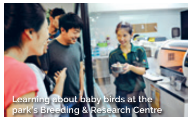
Learning about baby birds at the park's Breeding & Research Centre