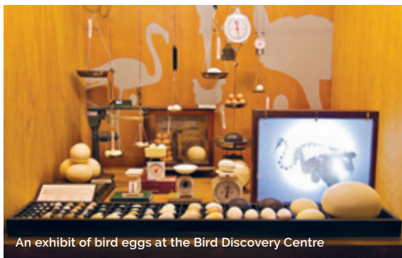
An exhibit of bird eggs at the Bird Discovery Centre

Children visiting the Bird Discovery Centre will learn about inventions that are inspired by birds, the largest egg in the world, and how many chicken eggs it equals. On weekends, docent stations manned by volunteers, offer tactile and sensorial experiences to excite