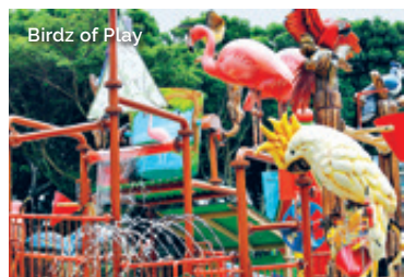
Birdz of Play