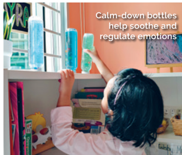
Calm-down bottles help soothe and regulate emotions