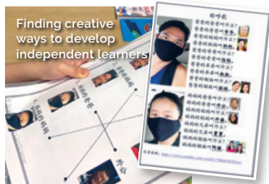
Finding creative ways to develop independent learners