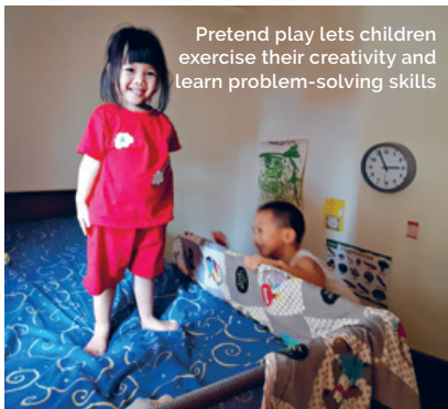
Pretend play lets children exercise their creativity and learn problem-solving skills

GEORGINA LEE , mother of three, aged 7, 5 and 4