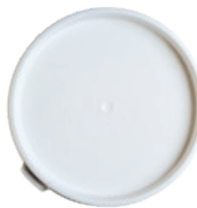
Plastic lid from food container (e.g. ice cream tub)