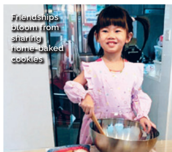
Friendships bloom from sharing home-baked cookies