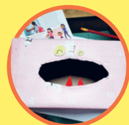
MIKAYLE LIN , 5

We showed you how to make a tissue box monster in the Oct–Dec 2021 issue. Here are the cute beasts some of you made.