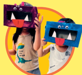
ARISSA AND AMBER LEE , 3 and 2