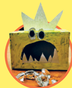
HE YUXUAN , 6