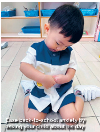
Ease back-to-school anxiety by asking your child about his day