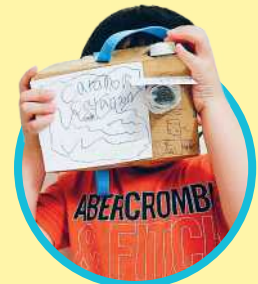
ELIAS KHO , 6