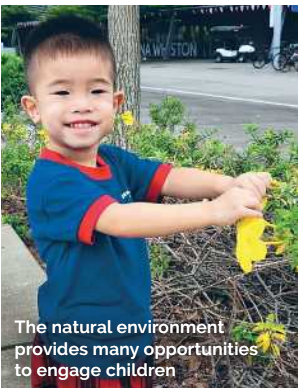
The natural environment provides many opportunities to engage children