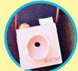
ALESHA KAYLA BINTE MOHAMED FAHD , 6