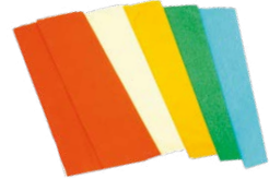
Coloured crepe or tissue paper