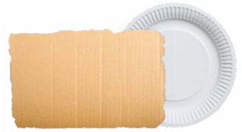
Sturdy paper (e.g., paper plate, card stock, recycled cardboard)