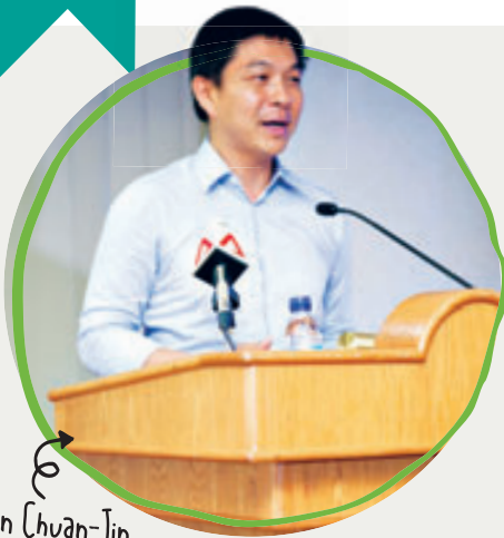
Mr Tan Chuan-Jin, Minister for Social and Family Development

ONE MONTH INTO his role as Minister for Social and Family Development, Mr Tan Chuan-Jin welcomed 14 exemplary early childhood professionals with high levels of leadership and professional expertise into the brand-new ECDA Fellows programme. He presented them with certificates at the ECDA Fellows Appointment Ceremony on 6 May 2015. Minister Tan said in his opening address that the ECDA Fellows programme