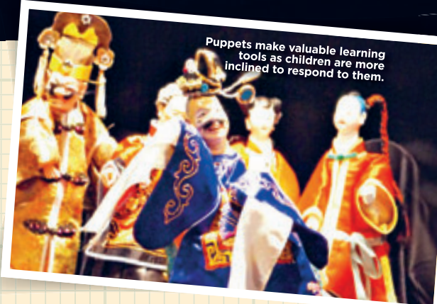
Puppets make valuable learning tools as children are more inclined to respond to them.