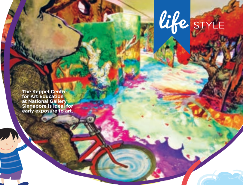
The Keppel Centre for Art Education at National Gallery Singapore is ideal for early exposure to art.