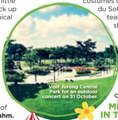
Visit Jurong Central Park for an outdoor concert on 31 October.

In celebration of Singapore's Golden Jubilee, the National Parks Board will hold outdoor concerts at Jurong Central Park on 31 October 2015 and Gardens by the Bay on 19 December 2015. Concert Series in the Park will feature well-known local talents alongside community performing groups. Kids can look forward to fringe activities at the concerts, such as bouncy castles and kite festivals. Admission to the concerts is free. For more information, visit nparks.gov.sg/sg50