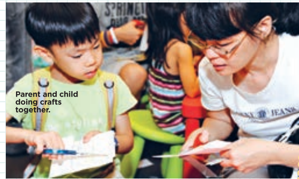
Parent and child doing crafts together.

Activities at the museum also provide a great opportunity for family bonding whilst discovering culture and heritage through the arts. The Straits Family Sunday event at the Peranakan Museum, held on every second Sunday of the month, gives families a chance to dress up in batik shirts and sarong kebayas. Parents and children can also choose to do arts and crafts together and create a pencil topper or a folder inspired by the