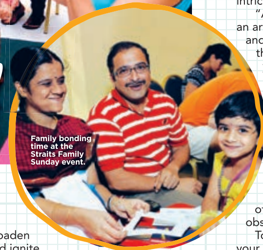
Family bonding time at the Straits Family Sunday event.