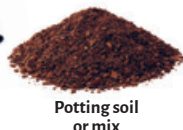
Potting soil or mix