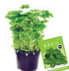
Herb or microgreen seeds