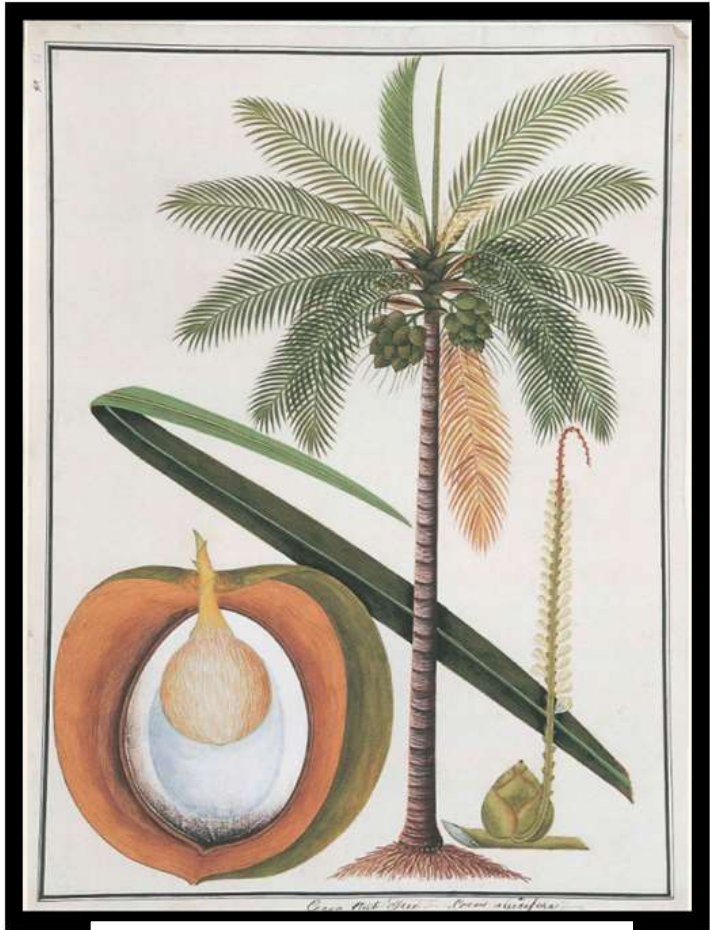
Cooking Nasi Lemak