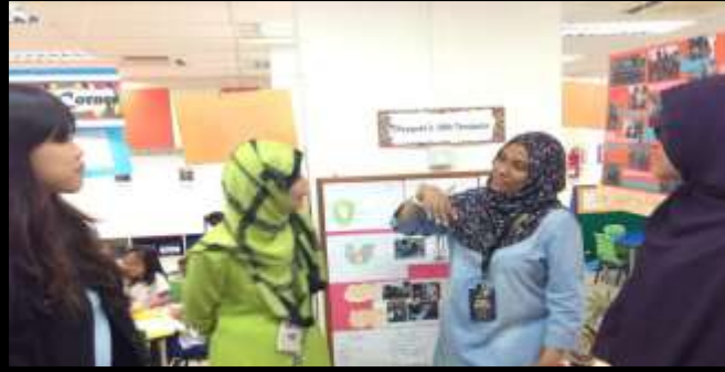
Visit to mentee centres