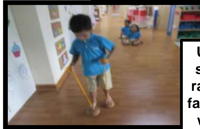
Using the shell for a race- "How fast can you walk with the shell?"