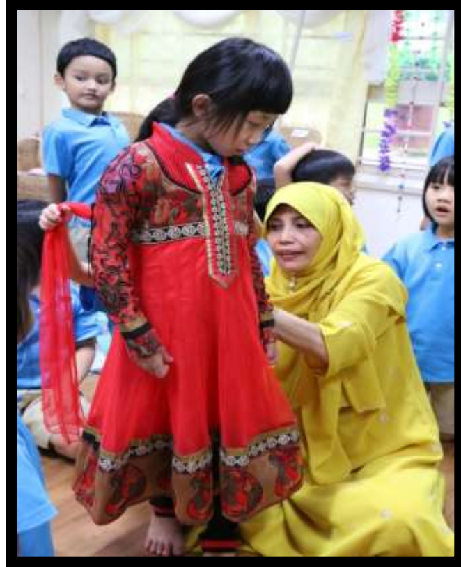
Sari-Draping and Sari-Folding Game