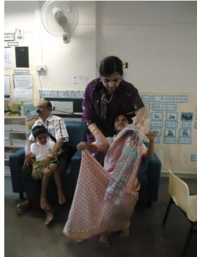
Experiences within the classroom