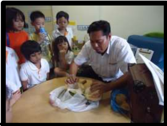
Child's parent helping in opening the coconut.