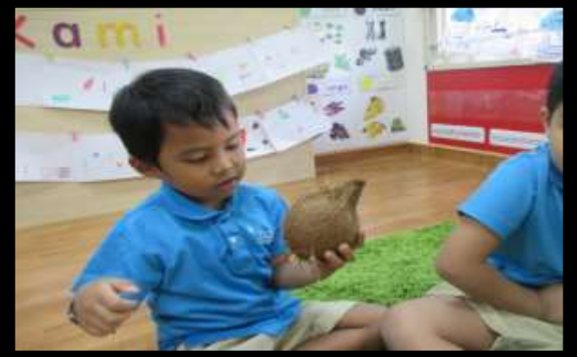
Observing the coconut shell, husk, core and meat.