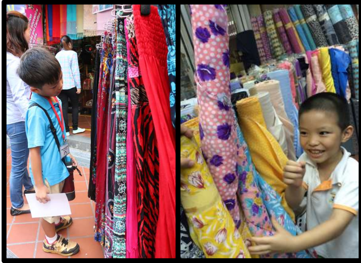
Visiting textile centre