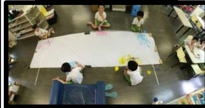
Painting the Sari