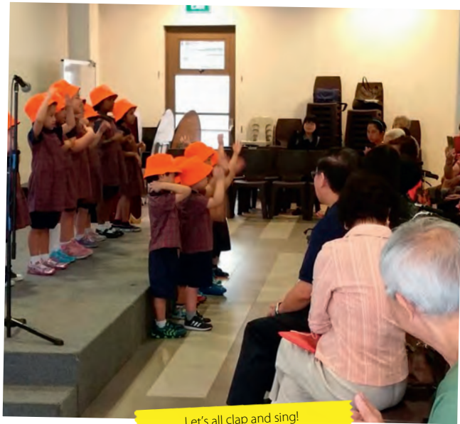
Let's all clap and sing!