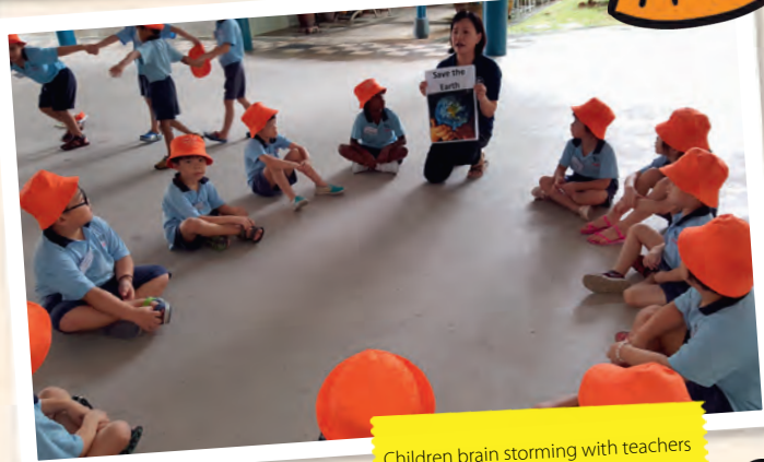
Children brain storming with teachers

Saving energy is often thought of as a job best left to adults, but getting children involved is a great way to show them that their actions have a big impact on their world, and proves to them that small steps can lead to big changes. Lesson on saving electricity was an interesting topic among the children. Children walked around the neighborhood carrying banner "Save the Earth". Children suggested to do the same with their family. Letters were sent out to parents on practical ways that they can save energy around the house. We received feedback on how parents and children had an opportunity to save electricity at home and spend quality outdoor time as a family.