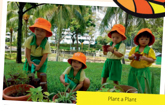
Plant a Plant