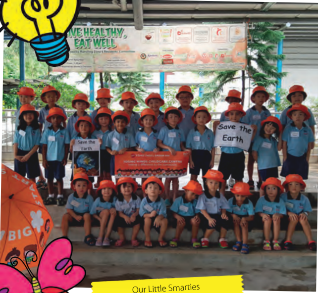
Our Little Smarties