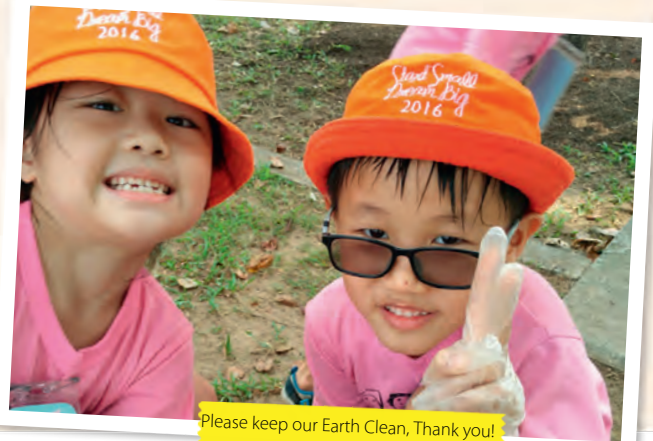
Please keep our Earth Clean, Thank you!

We planned a day to East Coast Park to pick up the litter. Through the activity, children felt that it is important for us to keep the environment clean by not littering.