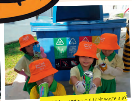
The children sorting out their waste into the recycling bin.