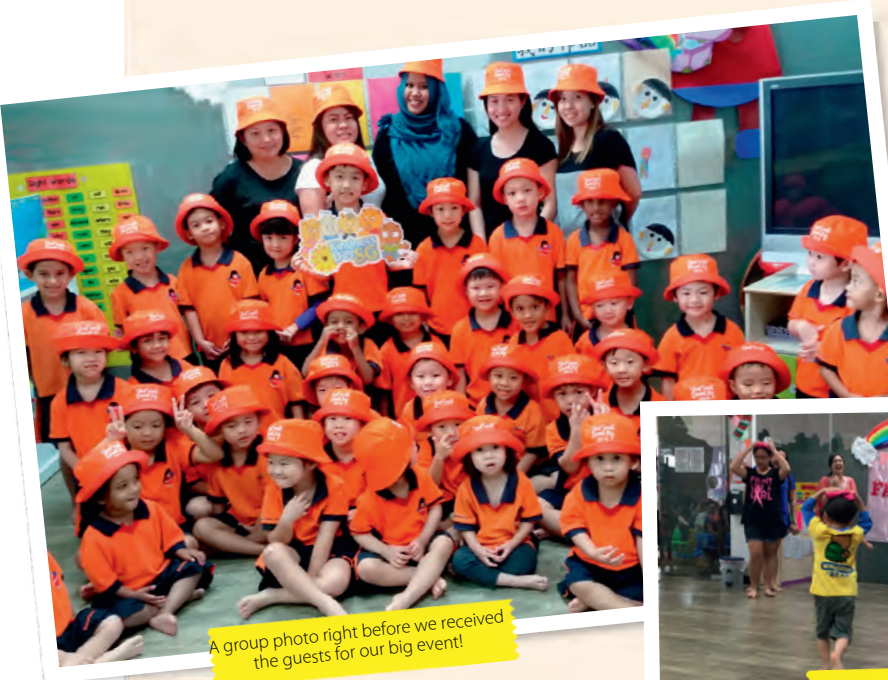
A group photo right before we received the guests for our big event!