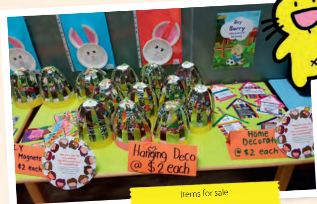
Items for sale

The children aged 4 to 6 years old expressed tremendous interest in making crafts with love and appreciation towards their parents and family members. Teachers and children discussed together, and created lovely crafts for sale and raised funds. They made family photo frames, book marks, magnets and more! With the help of teachers, the children agreed on the pricing, as well as the respective roles to assume on the day of Fund Raising Event.