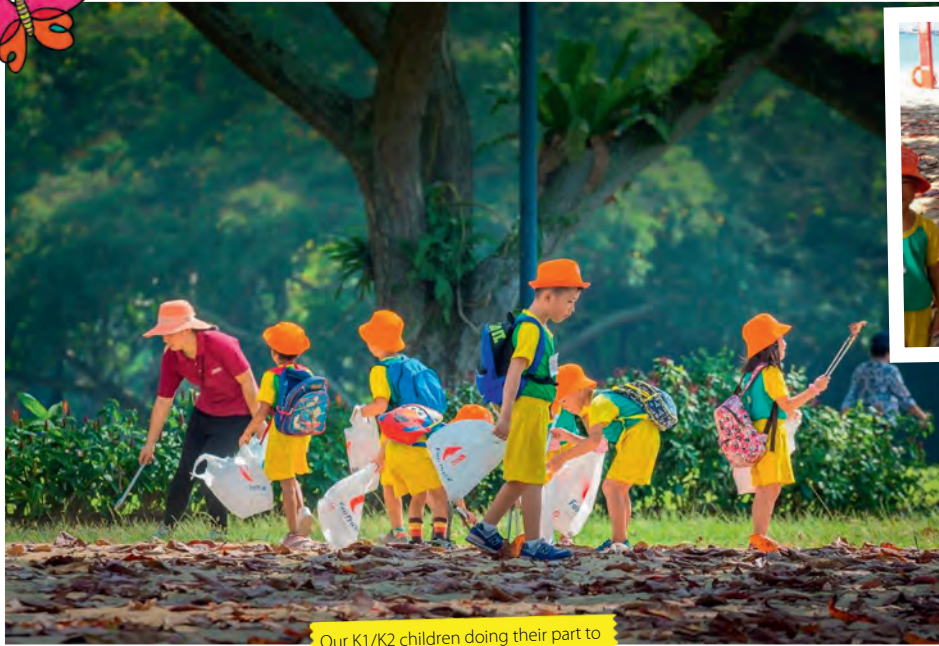
Our K1/K2 children doing their part to keep environment clean.