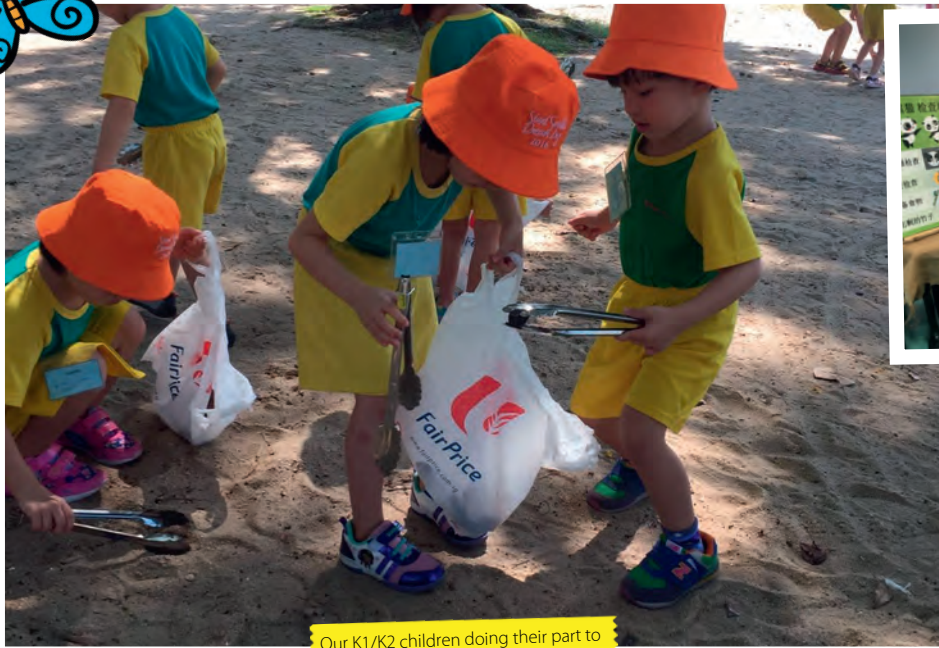
Our K1/K2 children doing their part to keep environment clean.