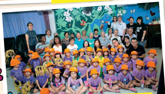
Bringing cheer to Beo Crescent Family Service Centre (: