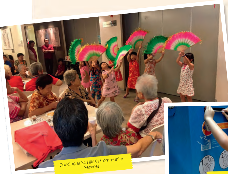
Dancing at St. Hilda's Community Services