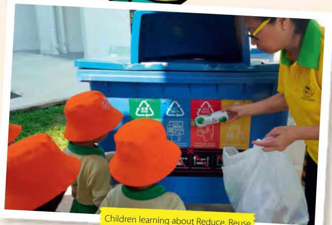
Children learning about Reduce, Reuse and Recycling.

The Nursery 1 and Playgroup children also did their part by cleaning up the park and playground near the child care centre!