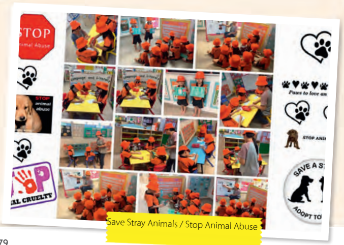
Save Stray Animals / Stop Animal Abuse