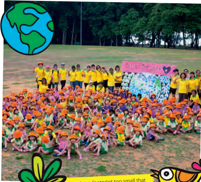
There is no footprint too small that cannot leave an imprint in this world