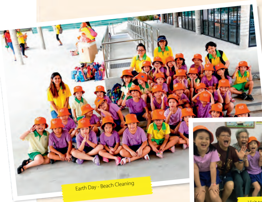
Earth Day - Beach Cleaning