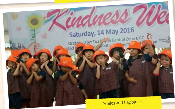
Smiles and happiness

Toa Payoh Methodist Church Kindergarten's SSDB project brought cheer to the seniors in our community. Starting small, we sang and danced to warm their hearts. We also gave presents to show that we care. Dreaming big, we exercised with them by learning their routines. We hope to promote an active lifestyle so that they will continue to be healthy and happy.