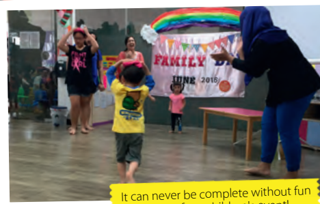
It can never be complete without fun games for a children's event!

Showing kindness does not make us grow poorer, try it and and you'll feel the joy! ~unknown~