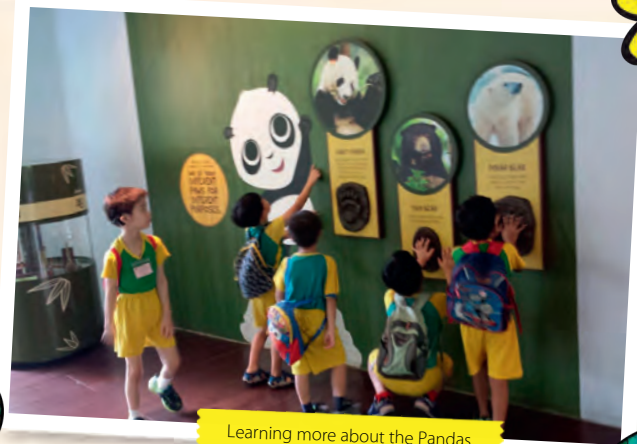
Learning more about the Pandas.