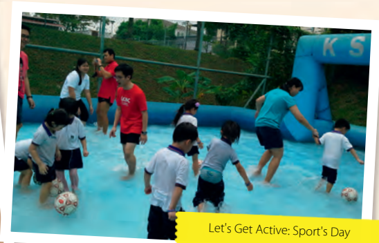
Let's Get Active: Sport's Day