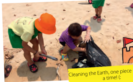
Cleaning the Earth, one piece of trash at a time! (: