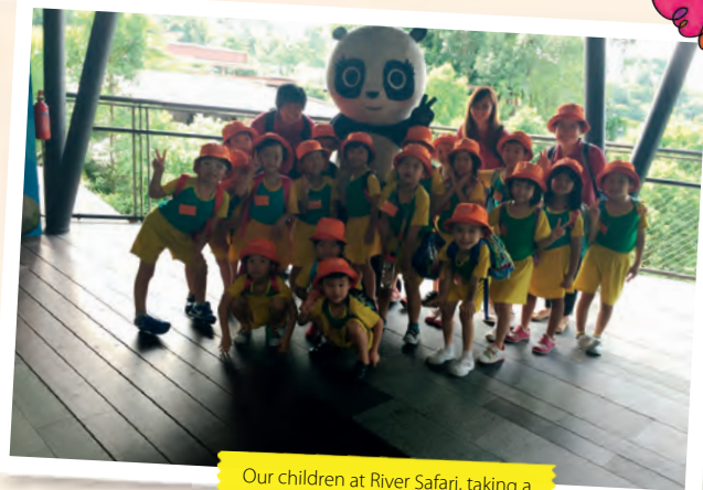
Our children at River Safari, taking a picture with 'Kai Kai'.