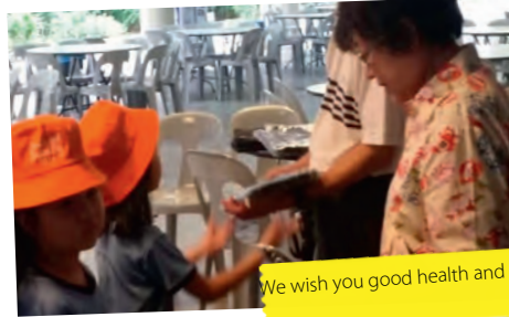
We wish you good health and happiness