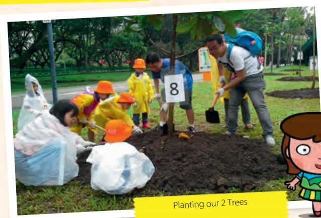
Planting our 2 Trees

Our children visited St. Hilda's to spread Chinese New Year cheer. Through the Little Green Dot Programme, children learned how to recycle Tetra Paks and became recycling ambassadors at home and in school. The children and their families also planted 2 trees in East Coat Park. Aside from helping the environment, we kept ourselves healthy through sports activities with our family.