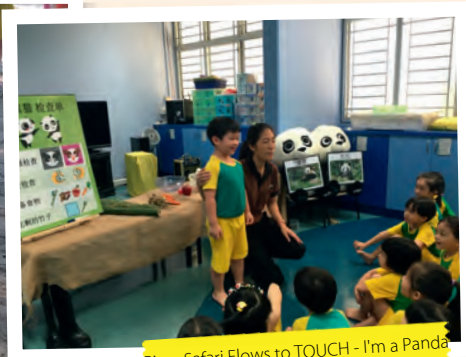
River Safari Flows to TOUCH - I'm a Panda Keeper.

"Little Hands, Big Heart.....LOVE our mother earth and protecting our environment."