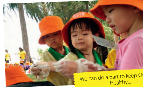
We can do a part to keep Our Earth Healthy...