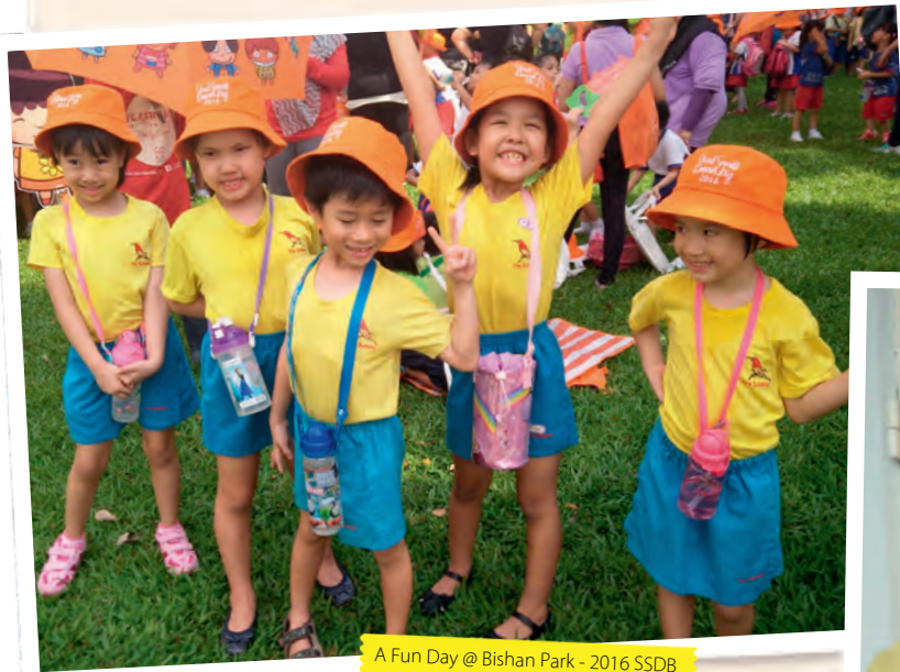
A Fun Day @ Bishan Park - 2016 SSDB Launch Party

At The Sunbird, we aim to develop children's sense of social responsibility, compassion and empathy in a fun way.