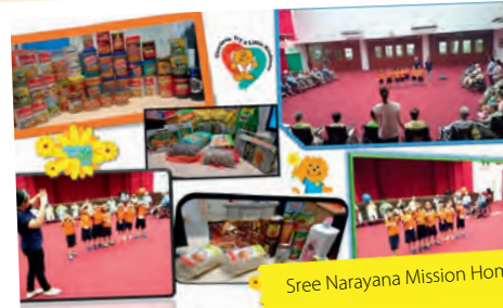
Sree Narayana Mission Home Visit