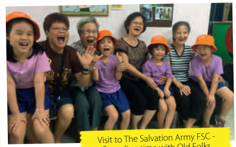
Visit to The Salvation Army FSC - Spending time with Old Folks

A small step goes a long way. Together we can make a difference.