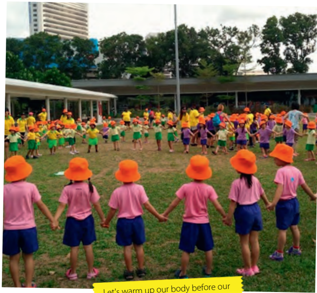
Let's warm up our body before our mission!