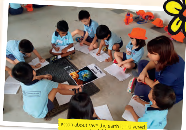
Lesson about save the earth is delivered to children

Saving energy is often thought of as a job best left to adults, but getting children involved is a great way to show them that their actions have a big impact on their world, and proves to them that small steps can lead to big changes. Lesson on saving electricity was an interesting topic among the children. Children walked around the neighborhood carrying banner "Save the Earth". Children suggested to do the same with their family. Letters were sent out to parents on practical ways that they can save energy around the house. We received feedback on how parents and children had an opportunity to save electricity at home and spend quality outdoor time as a family.