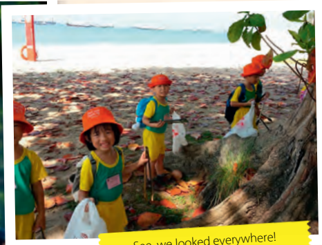
See, we looked everywhere!

"Little Hands, Big Heart.....LOVE our Mother Earth and protecting our environment."