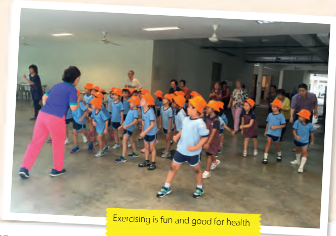
Exercising is fun and good for health