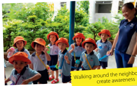
Walking around the neighborhood to create awareness