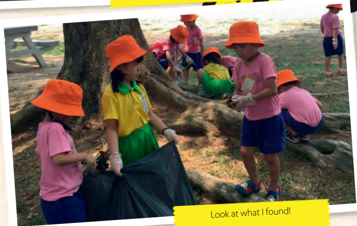
Look at what I found!

In The Salvation Army, our Teachers and children believe in "Love" and "Respect" toward self, others as well as environment.