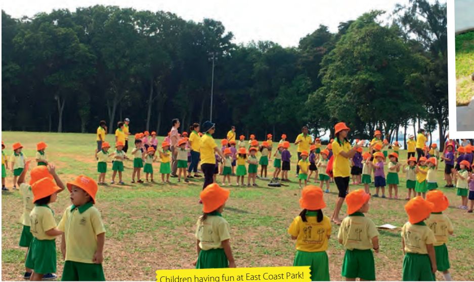
Children having fun at East Coast Park!