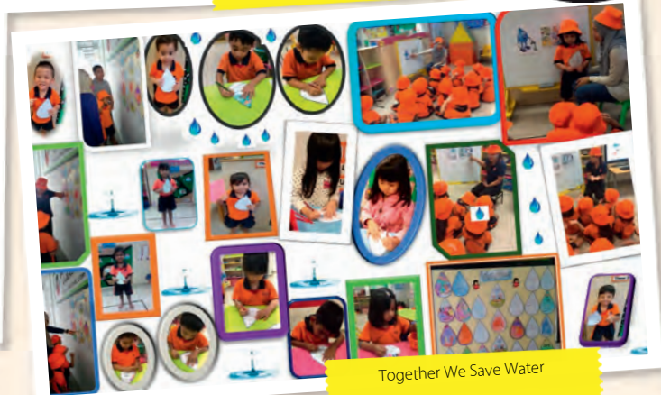
Together We Save Water

Our centre participated in the Start Small Dream Big Project by organizing several activities for our children. Our children visited the Sree Narayana Mission Home. This provided an opportunity for our children to remember the elderly. Parents contributed grocery items and donated money for the elderly. Children also learned about water conservation. They had fun hands-on activities related to saving water, such as colouring and picture talk. Children also learned about the 3 R's, Reduce, Recycle and Reuse. Parents were also involved by contributing the recycling items. Teachers also taught children about the importance of being kind to animals, caring for the pets, save stray animals and to stop animal abuse.