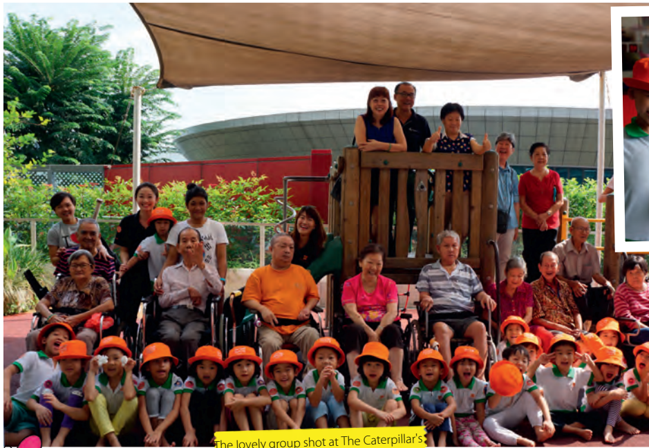
The lovely group shot at The Caterpillar's Cove Playground