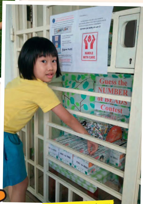
Raise funds for the needy in a fun way.

Our childcare centre, together with our partners from Alliance First consortium, also organized a "GUESS THE NUMBER OF BEADS CONTEST" to raise funds for the needy.