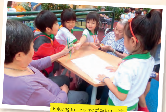
Enjoying a nice game of pick up sticks with our friends at Hua Mei

The SSDB project set the children on a journey filled with laughter and heartfelt moments. With play as a central experience to promote intergenerational partnership, the community at The Caterpillar's Cove Child Development and Study Centre and Hua Mei Elderly Care Centre forged a relationship that encouraged the understanding and acceptance of diversity. The children visited Hua Mei centre and engaged in various activities together. This relationship extended into a co-facilitation of a games day for all the Cove children and their grandparents at The Caterpillar's Cove.