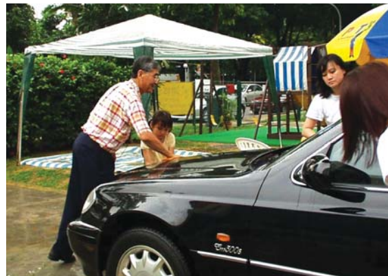
Collaborating with families in community work (such as washing cars to raise funds for charity)