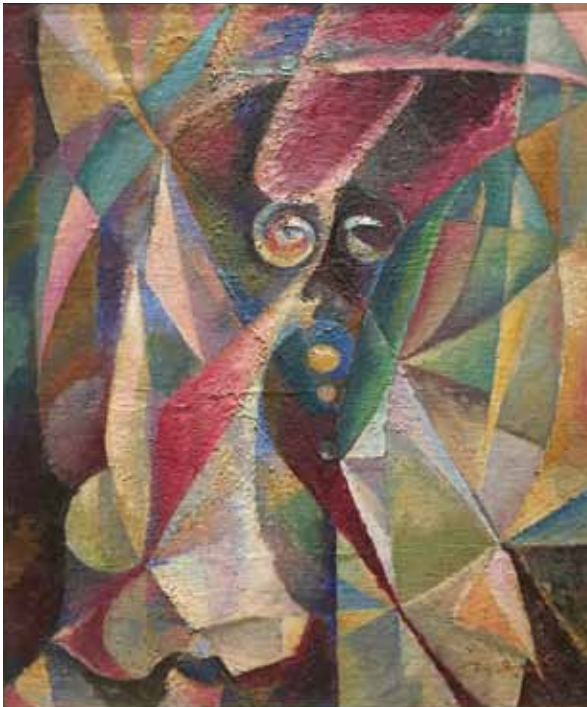
9 Fua Haribhitak. Face . c. 1956. Collection of National Gallery Singapore.